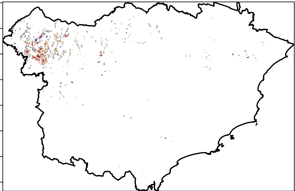
Total Vegetation Cover Decile [%]

Deciles show where the pixel value lies in the record, from highest to lowest, for that month. That is, red pixels are in the lowest 10% of records for that month of the map using baseline from 2001 to 2019.