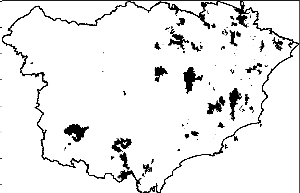
% Area protected from wind erosion (>50%)

Area protected 100.0% of region (218,575 ha)