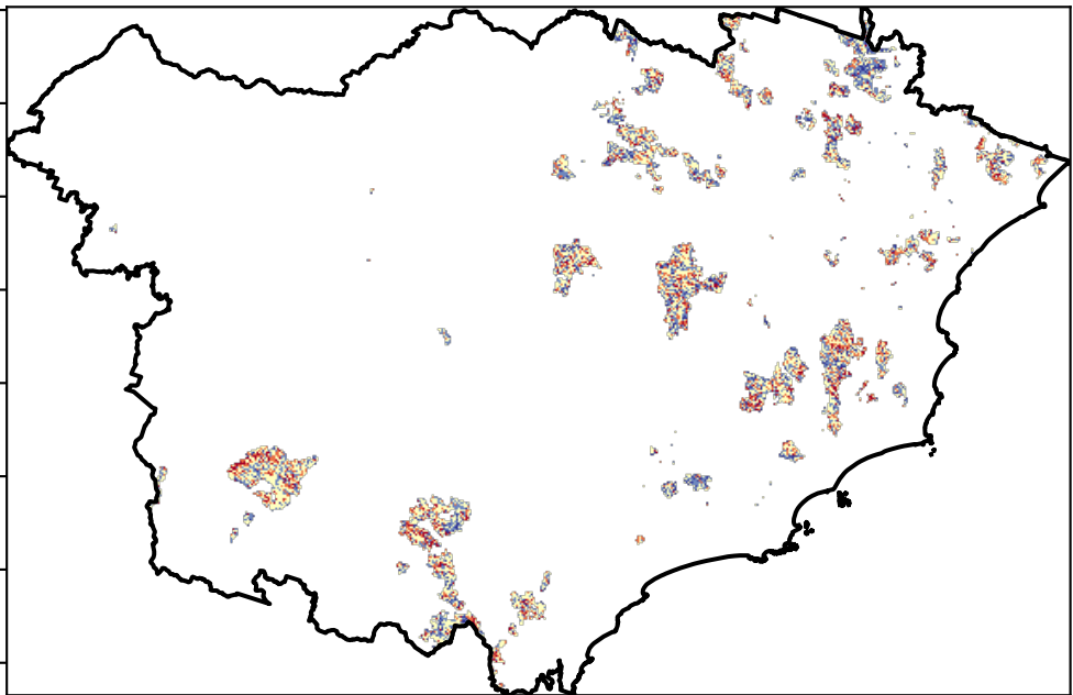
Total Vegetation Cover Decile [%]

Deciles show where the pixel value lies in the record, from highest to lowest, for that month. That is, red pixels are in the lowest 10% of records for that month of the map using baseline from 2001 to 2019.