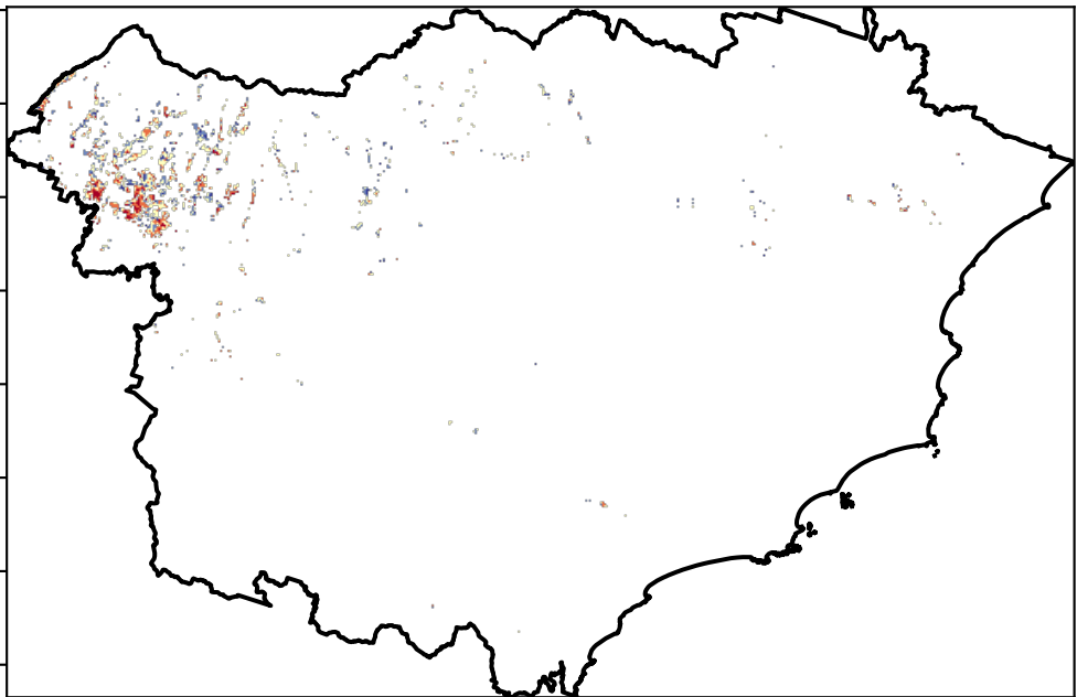
Total Vegetation Cover Decile [%]

Deciles show where the pixel value lies in the record, from highest to lowest, for that month. That is, red pixels are in the lowest 10% of records for that month of the map using baseline from 2001 to 2019.