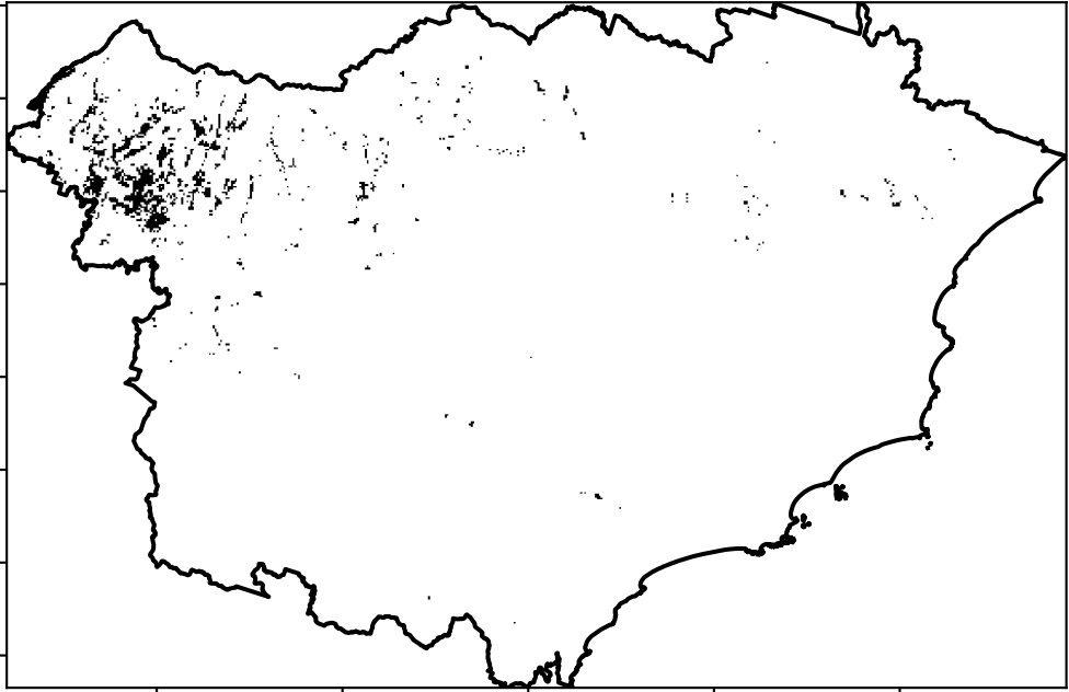
% Area protected from wind erosion (>50%)

Area protected 100.0% of region (50,625 ha)