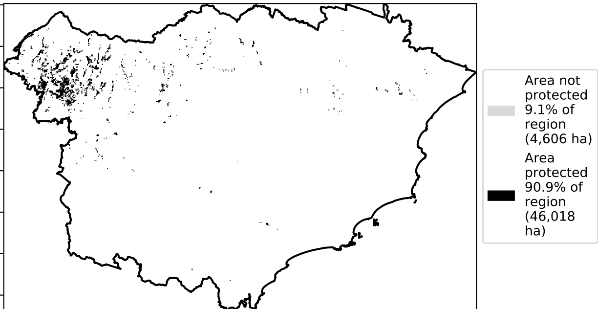
% Area protected from water erosion (>70%)