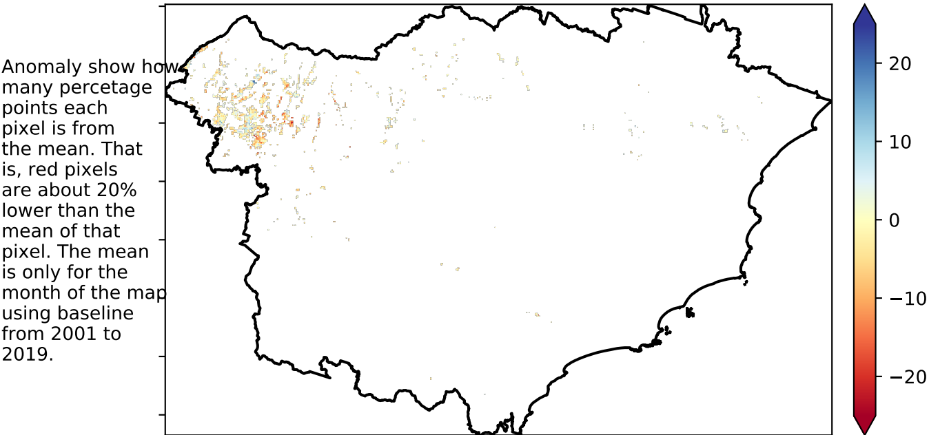
Total Vegetation Cover Anomaly [%]