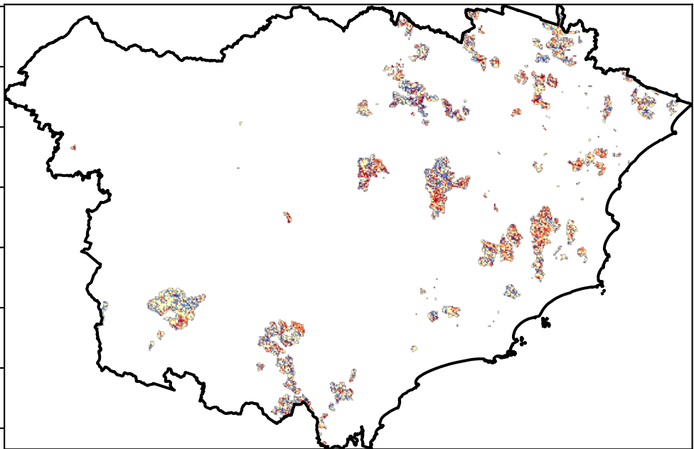
Total Vegetation Cover Decile [%]

Deciles show where the pixel value lies in the record, from highest to lowest, for that month. That is, red pixels are in the lowest 10% of records for that month of the map using baseline from 2001 to 2019.