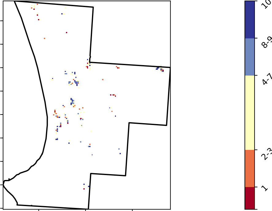
Total Vegetation Cover Decile [%]

Deciles show where the pixel value lies in the record, from highest to lowest, for that month. That is, red pixels are in the lowest 10% of records for that month of the map using baseline from 2001 to 2019.