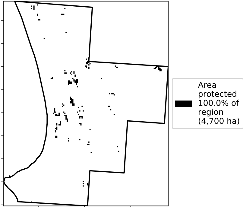
% Area protected from water erosion (>70%)