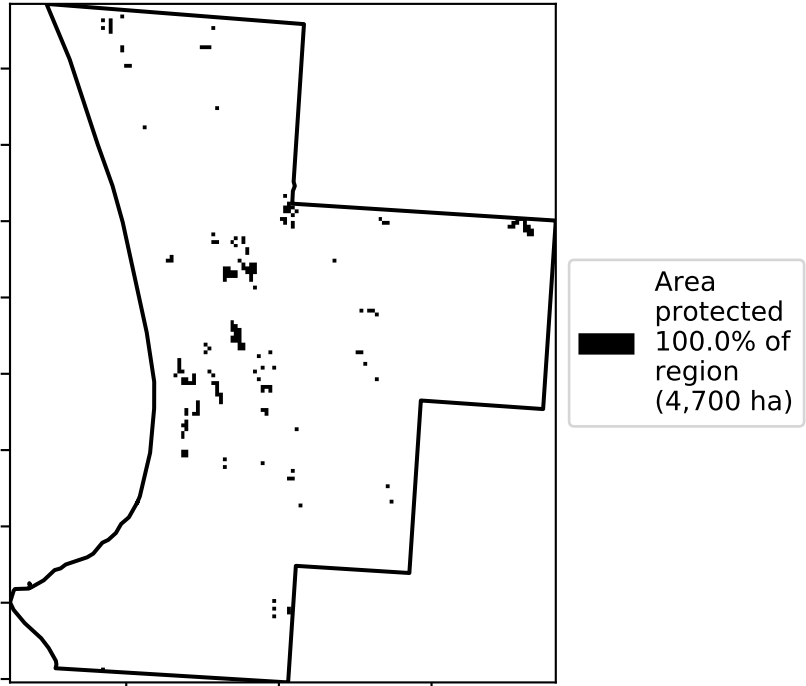
% Area protected from wind erosion (>50%)