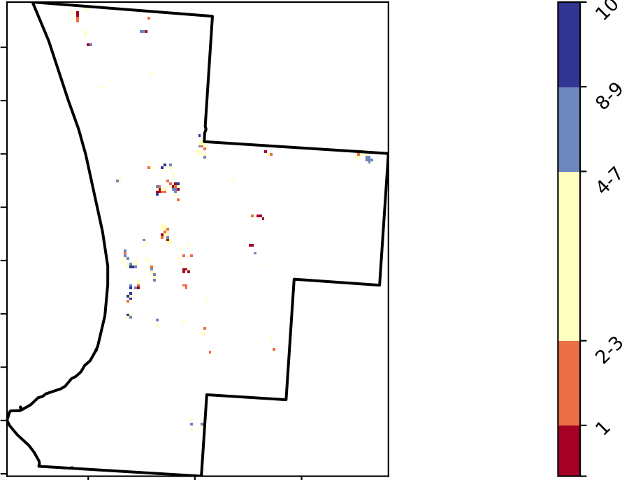
Total Vegetation Cover Decile [%]

Deciles show where the pixel value lies in the record, from highest to lowest, for that month. That is, red pixels are in the lowest 10% of records for that month of the map using baseline from 2001 to 2019.