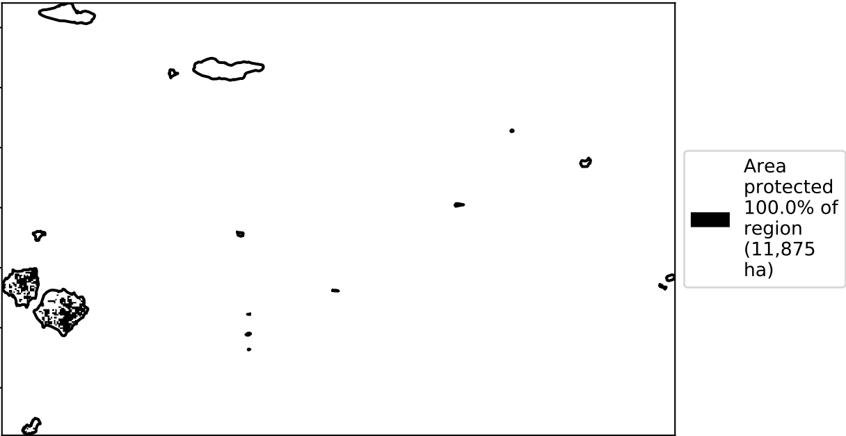
% Area protected from water erosion (>70%)