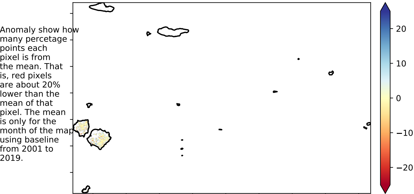
Total Vegetation Cover Anomaly [%]