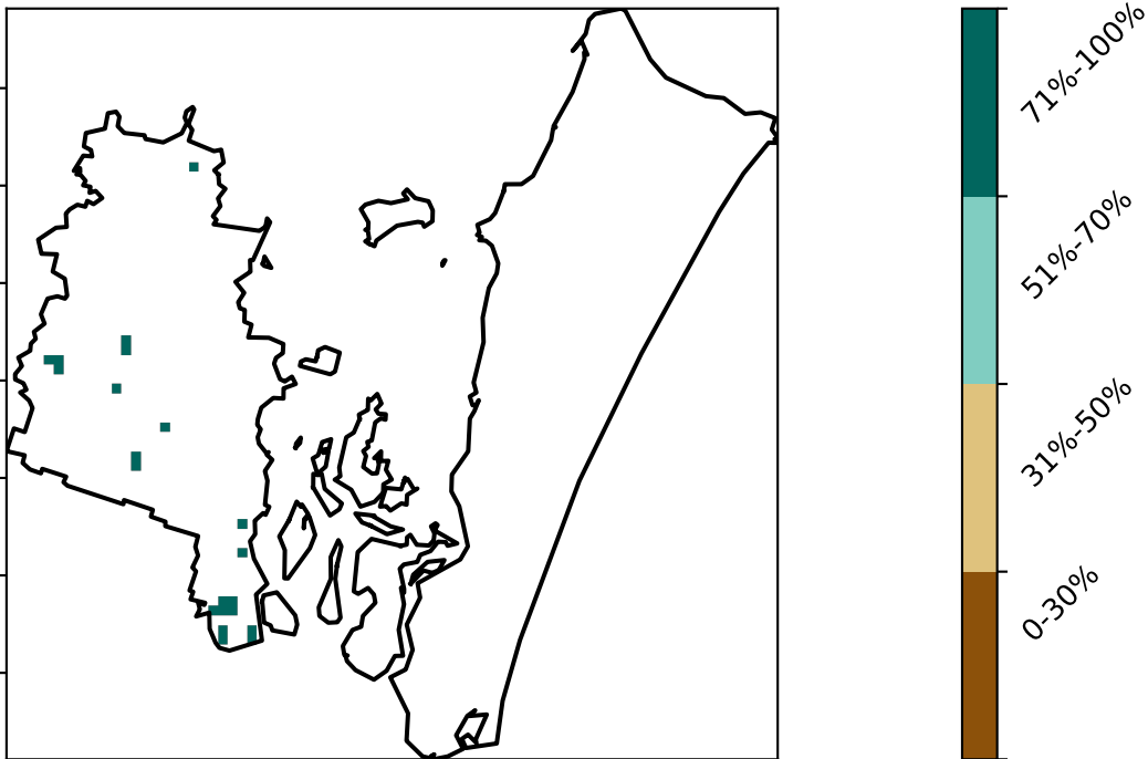
Proportion of vegetation cover class in area