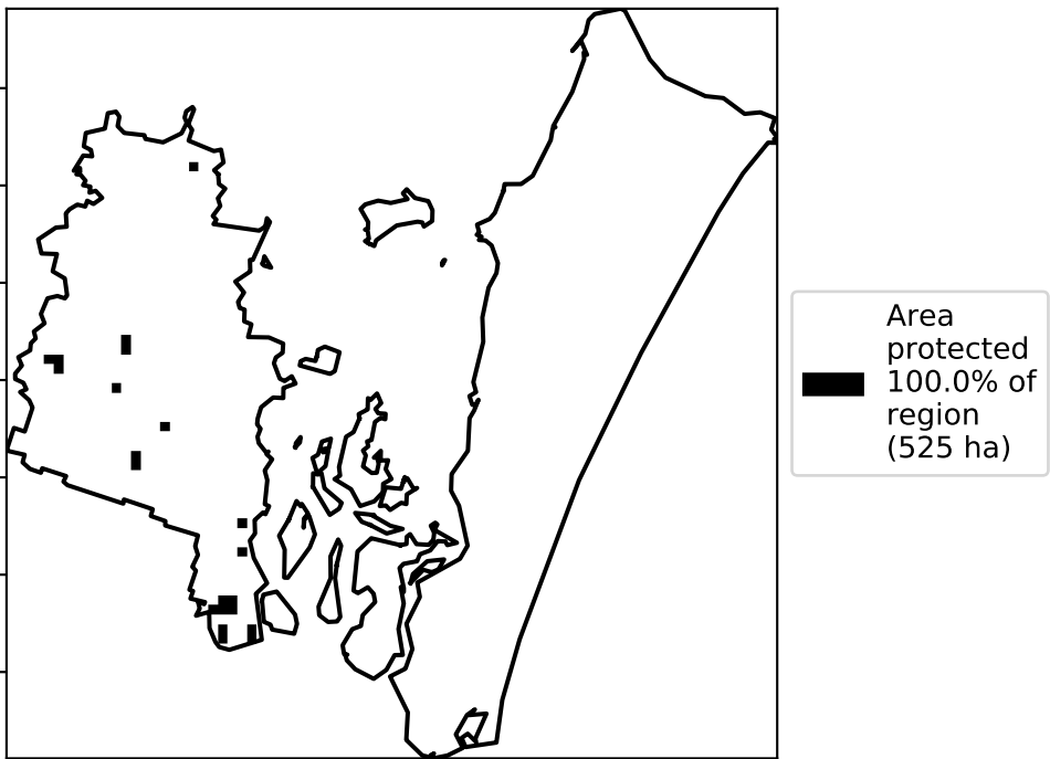
% Area protected from wind erosion (>50%)