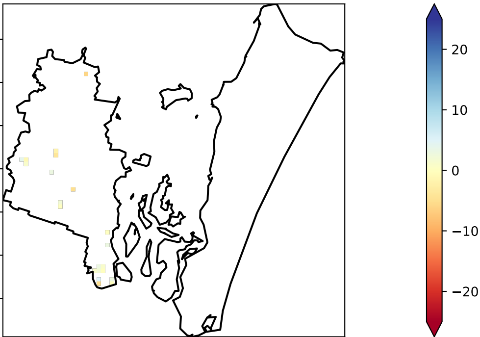
Total Vegetation Cover Anomaly [%]