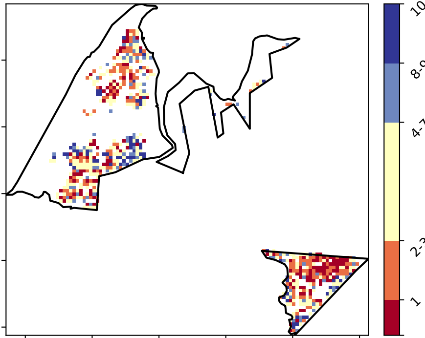
Total Vegetation Cover Decile [%]

Deciles show where the pixel value lies in the record, from highest to lowest, for that month. That is, red pixels are in the lowest 10% of records for that month of the map using baseline from 2001 to 2019.