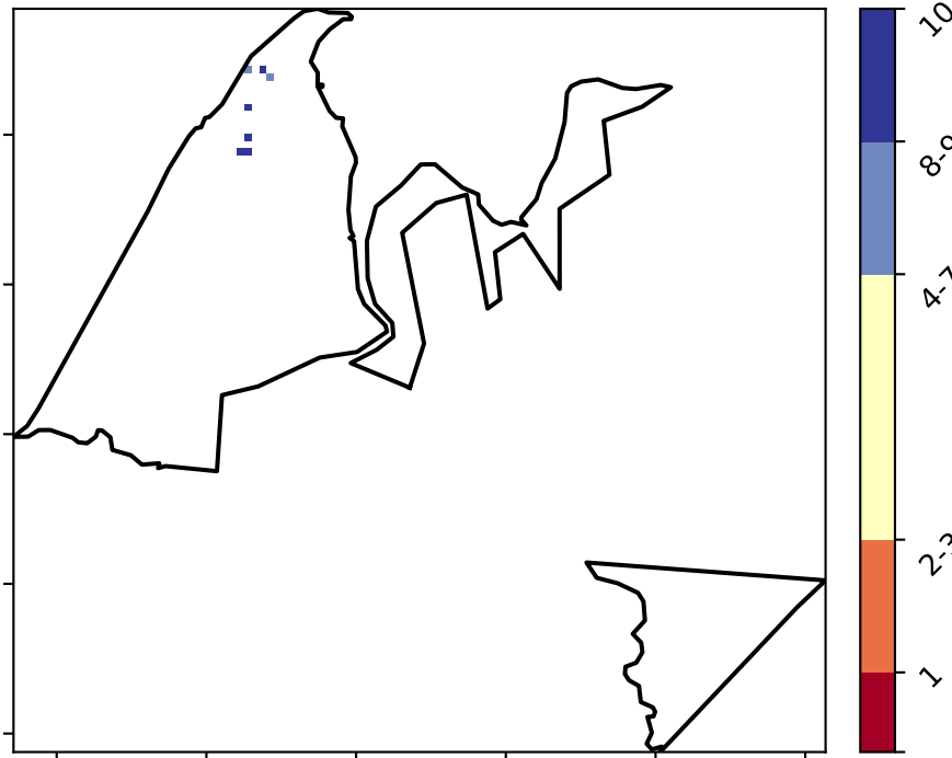
Total Vegetation Cover Decile [%]

Deciles show where the pixel value lies in the record, from highest to lowest, for that month. That is, red pixels are in the lowest 10% of records for that month of the map using baseline from 2001 to 2019.