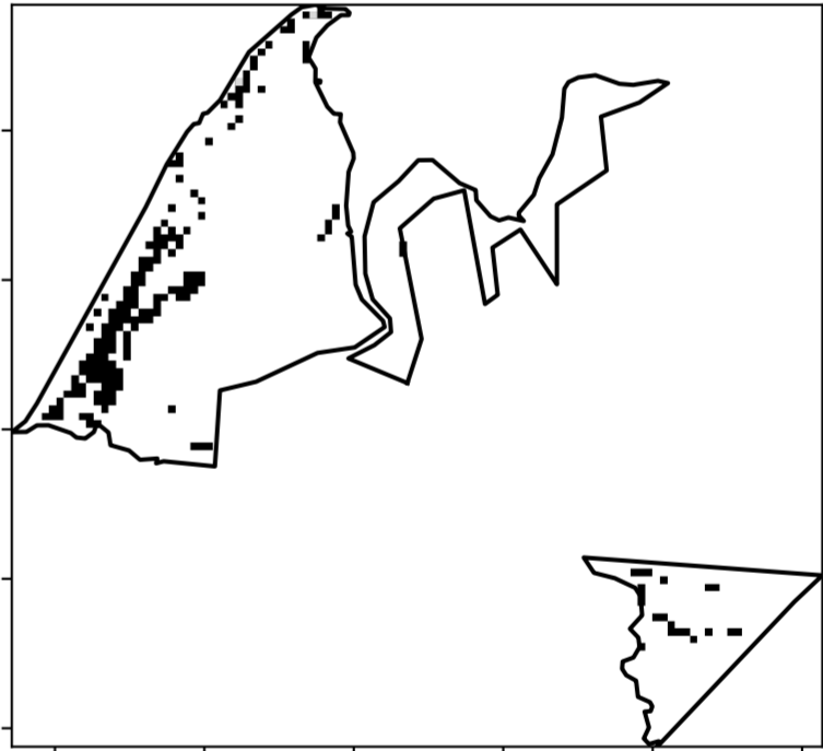
% Area protected from wind erosion (>50%)

Area not protected 1.0% of region (48 ha) Area protected 99.0% of region (4,826 ha)