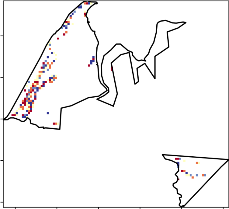
Total Vegetation Cover Decile [%]

Deciles show where the pixel value lies in the record, from highest to lowest, for that month. That is, red pixels are in the lowest 10% of records for that month of the map using baseline from 2001 to 2019.