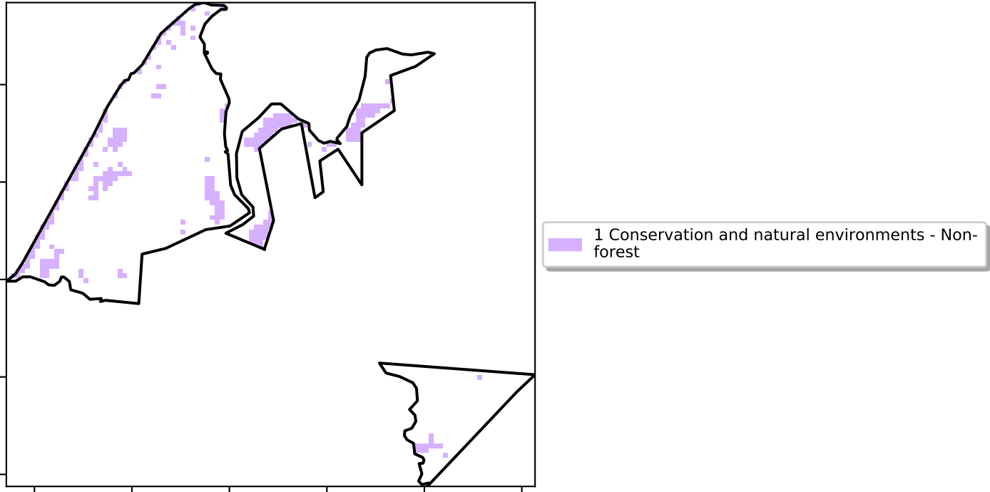
Total Vegetation Cover [%]

Catchment Scale Land Use and Forests of Australia (2018) Derived from Catchment Scale Land Use of Australia (2018) and Forests of Australia (2018)