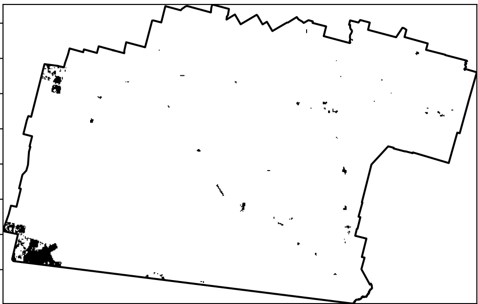
% Area protected from wind erosion (>50%)

Area protected 100.0% of region (40,400 ha)