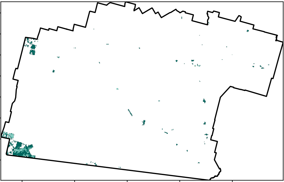
Total Vegetation Cover [%]

1 Conservation and natural environments - Non-forest