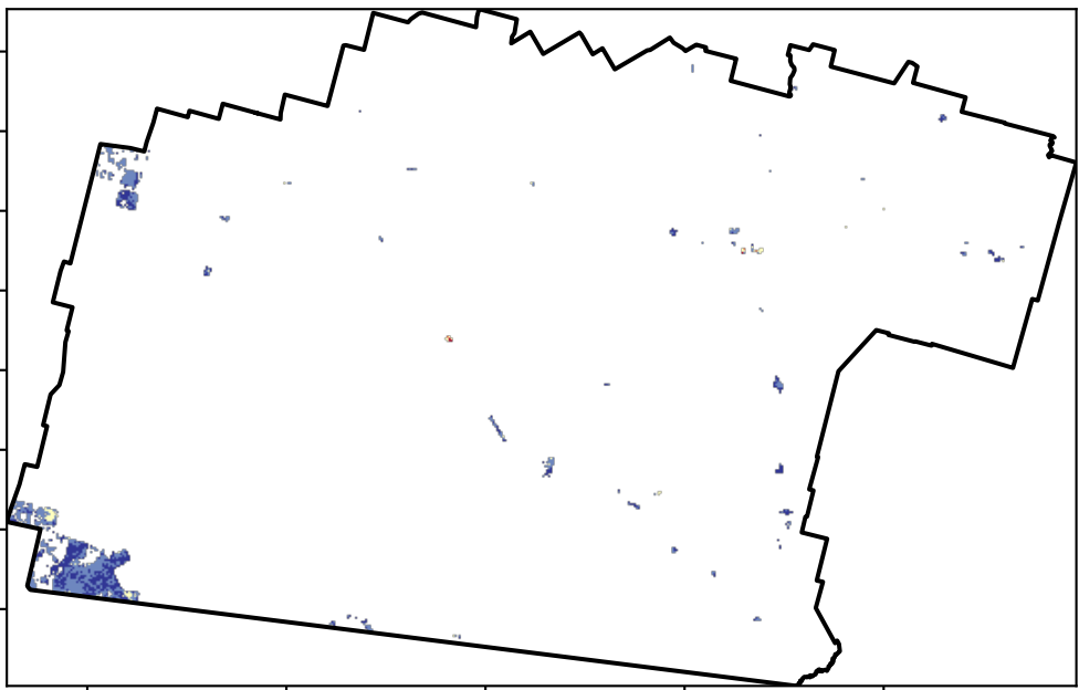
Total Vegetation Cover Decile [%]

Deciles show where the pixel value lies in the record, from highest to lowest, for that month. That is, red pixels are in the lowest 10% of records for that month of the map using baseline from 2001 to 2019.