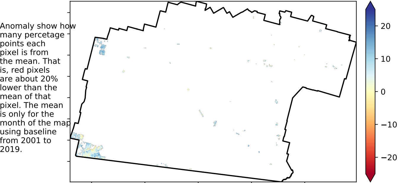
Total Vegetation Cover Anomaly [%]