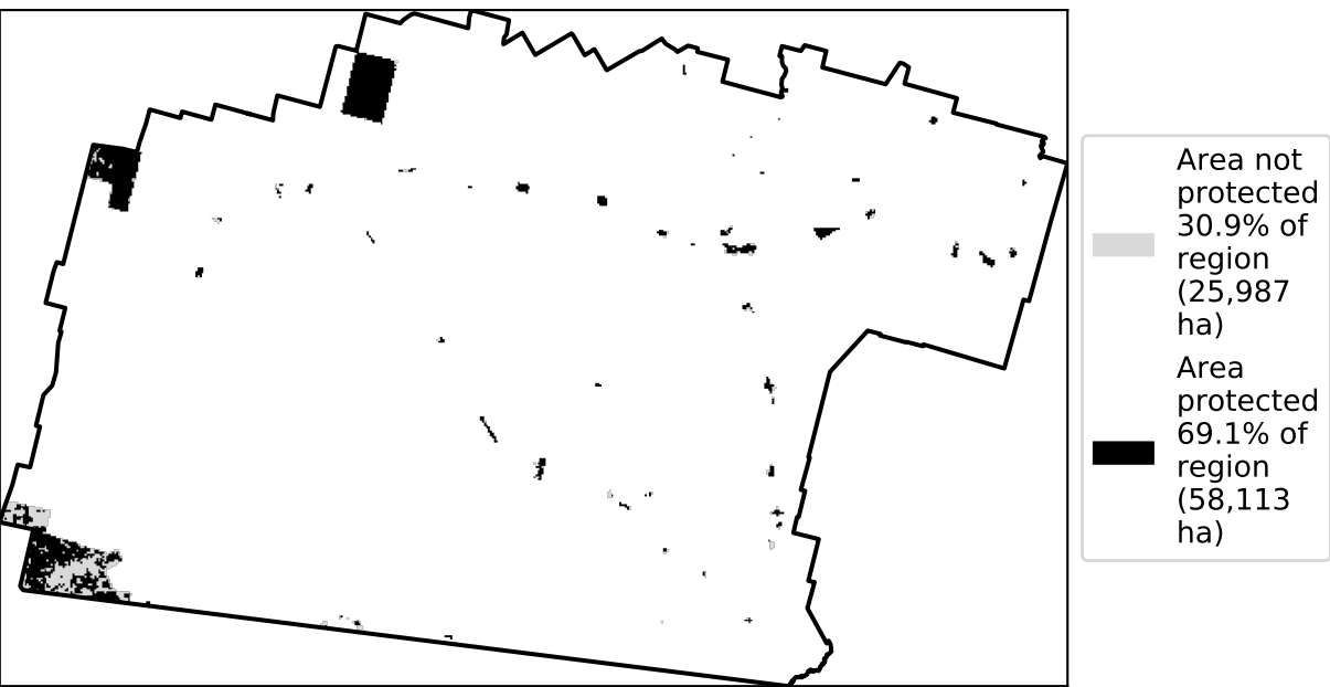
% Area protected from water erosion (>70%)