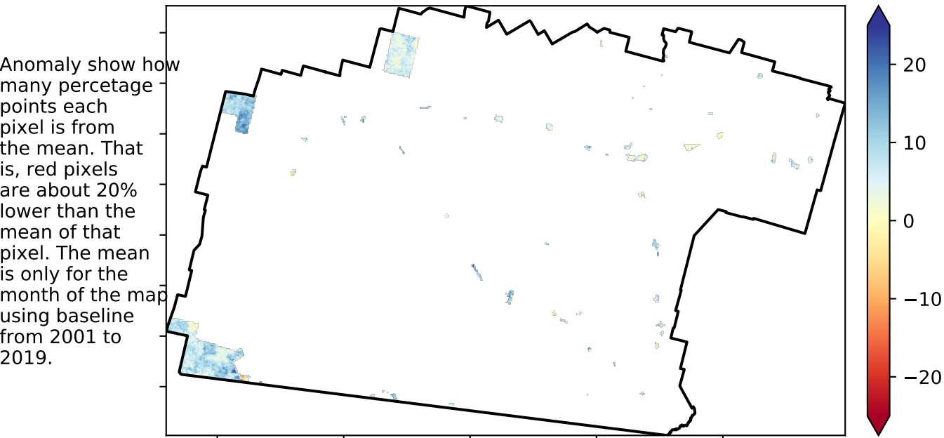
Total Vegetation Cover Anomaly [%]