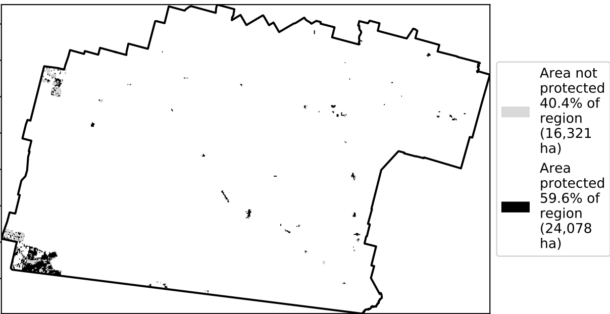
% Area protected from water erosion (>70%)