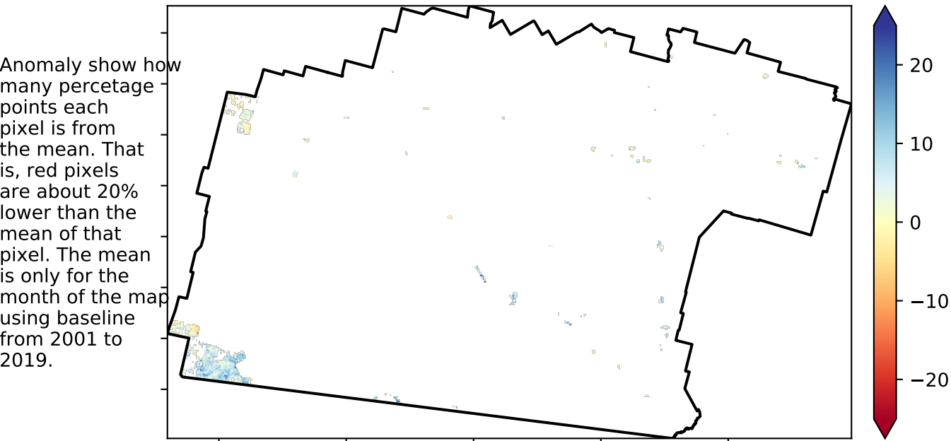
Total Vegetation Cover Anomaly [%]