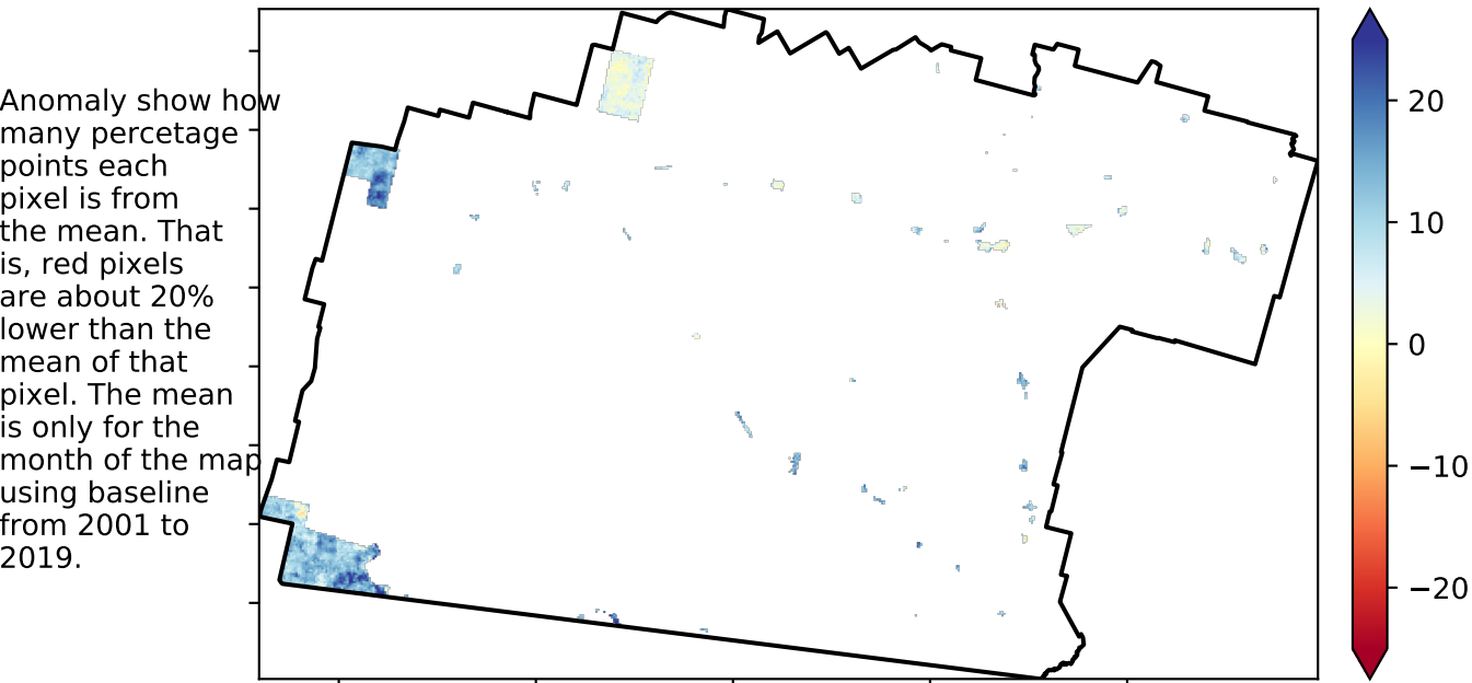
Total Vegetation Cover Anomaly [%]