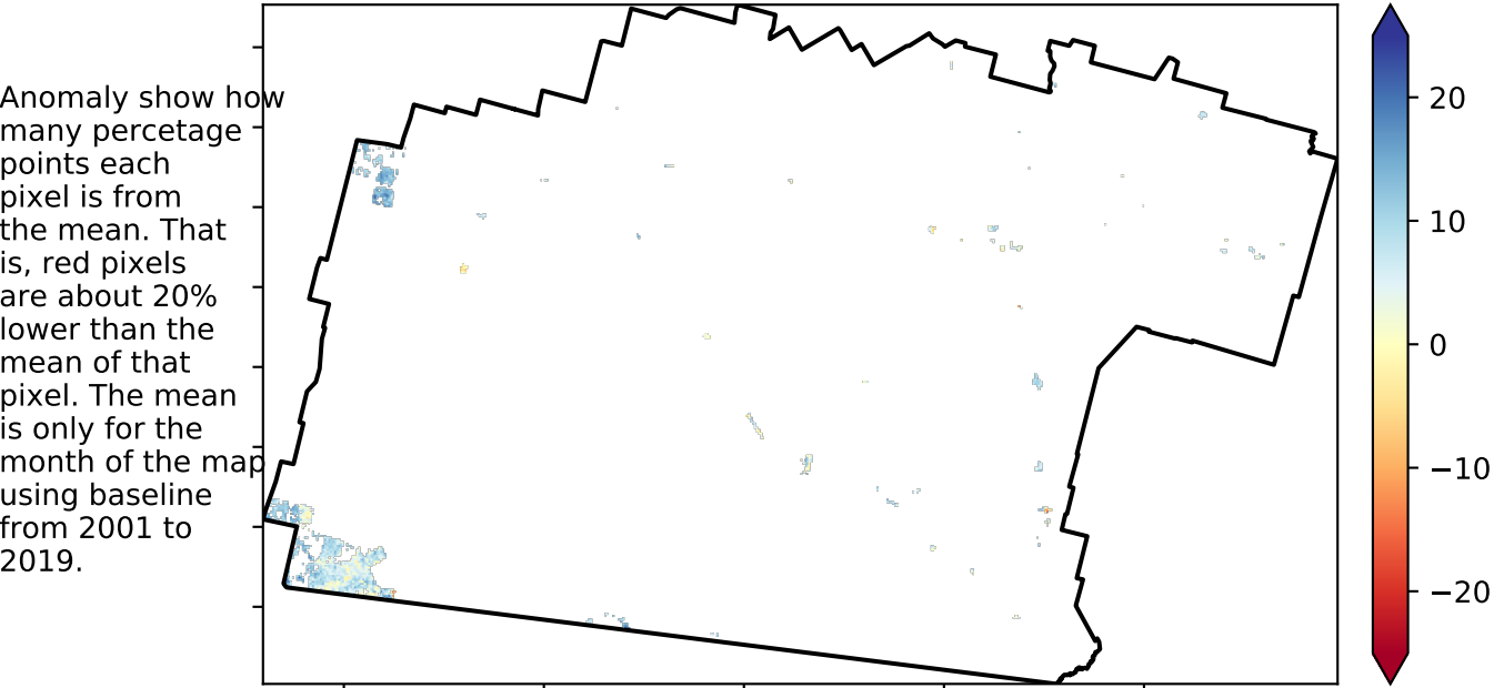
Total Vegetation Cover Anomaly [%]