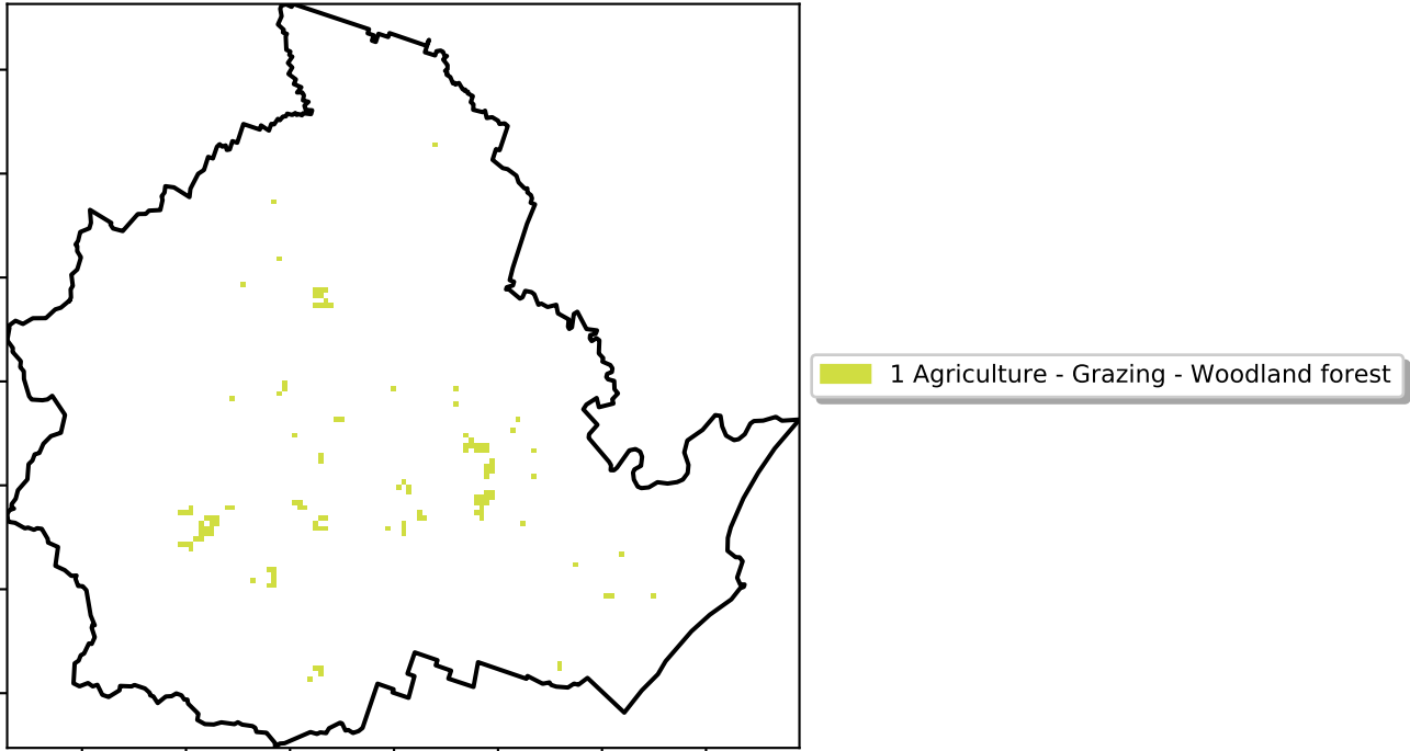
Total Vegetation Cover [%]

Catchment Scale Land Use and Forests of Australia (2018) Derived from Catchment Scale Land Use of Australia (2018) and Forests of Australia (2018)