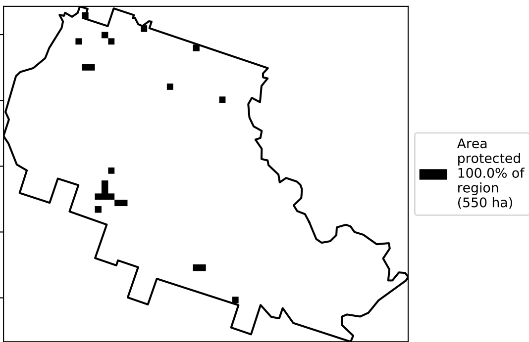
% Area protected from wind erosion (>50%)