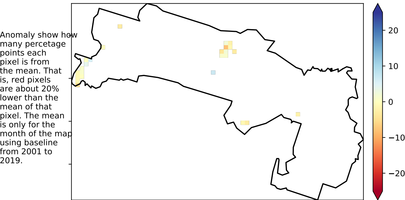
Total Vegetation Cover Anomaly [%]